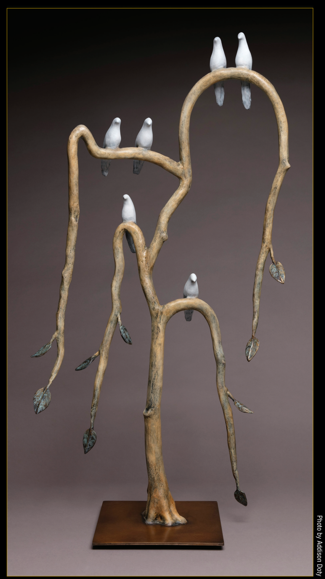
Psalms 45" High Edition of 9